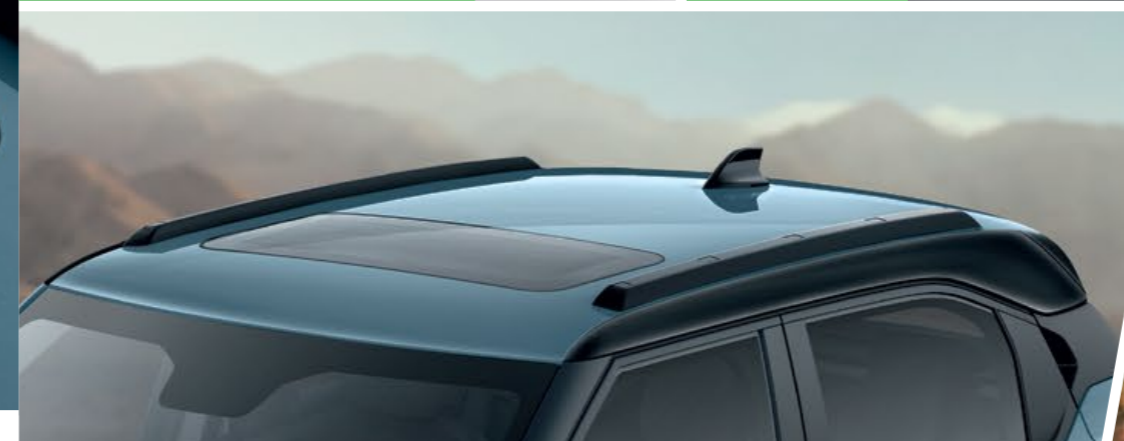
ROOF RAILS & SHARK FIN ANTENNA