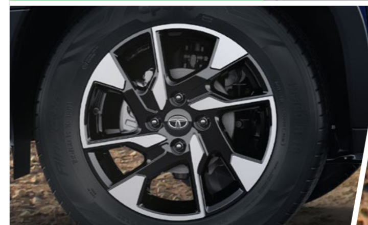
R16 DIAMOND CUT ALLOYS