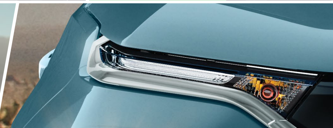
SIGNATURE LED DRLS