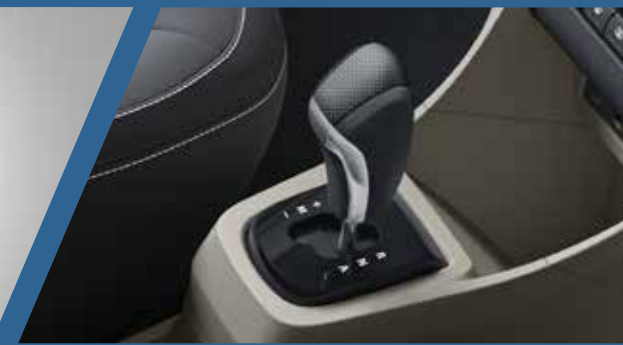
Advance AMT Transmission