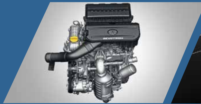
Max Power-86 ps @ 6000 r/min

Who says a peppy drive can't be thrilling? The Advanced AMT Transmission of Tiago lets you zip through any road without shifting a gear. The 1.2 L Revotron BS6 Ph2 petrol engine with the power of 86 ps @ 6000 r/min gives you an all-round performance.